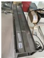
Reference: LFR-084 LOCKER ROOM BENCH Year: . Brand: .