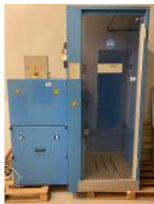
Reference: LFR-008 AIR SHOWER CABIN Year: 2001 Brand: MUNDER