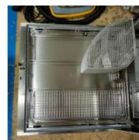
Reference: LFR-091 WASHER, DRYER FOR GLASSWARE Year: . Brand: LANCER