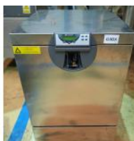
Reference: LFR-030 WASHER, DRYER FOR GLASSWARE Year: . Brand: LANCER