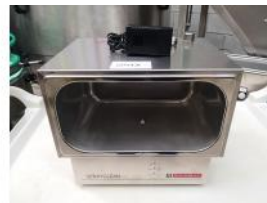
Reference: LFR-041 SMALL TOOLS SANITIZER Year: . Brand: NICOMAC